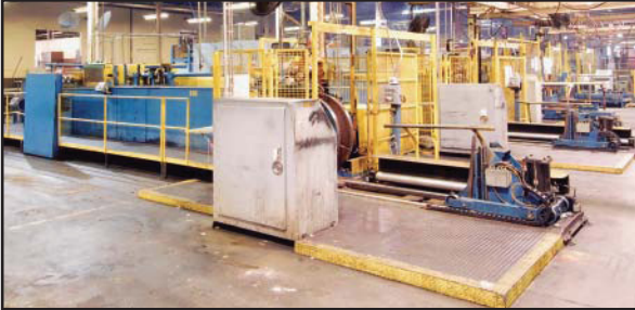
View of level winders