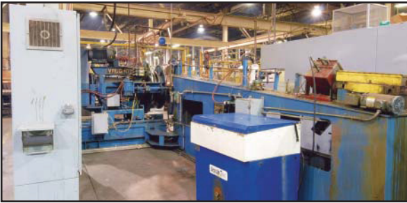
VAUGHN level winders